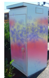
Sample Sketch and Wrap