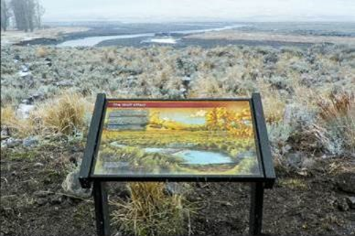
TRADITIONAL LOW PROFILE