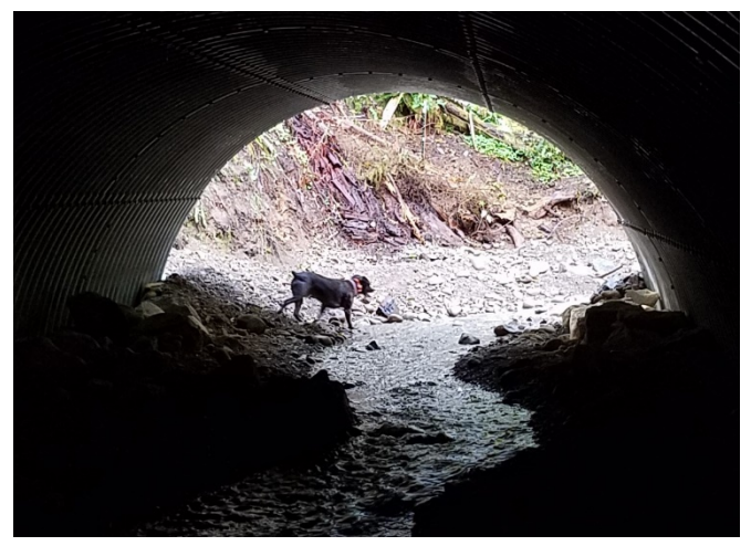
(DNR, Elkhorn Creek, example fish passage culvert)

all life stages, and dry streambanks inside the culvert to provide passage for terrestrial wildlife. Fish culverts must also pass the 100-year storm and all expected sediment and debris. (see photo example)