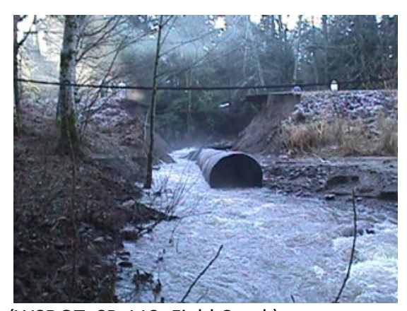
(WSDOT, SR-112, Field Creek)

The industry standard for culvert design life is 50 years minimum. Older corrugated metal pipes last 40 - 50 years and the bottoms are usually gone by 60 years. Concrete pipes can last over 100 years if in good condition, but there are other failure mechanisms besides the culvert breaking or losing its shape (see picture for example). This pipe was undersized and unable to pass debris during a flood.