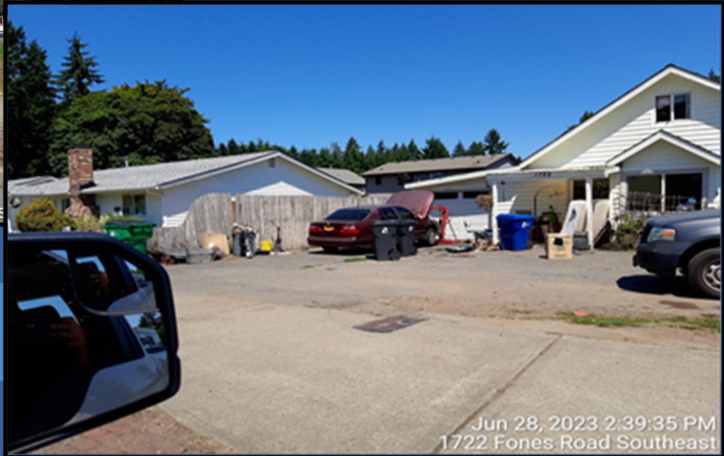
Jun 28, 2023 2:39:35 PM 1722 Fones Road Southeast