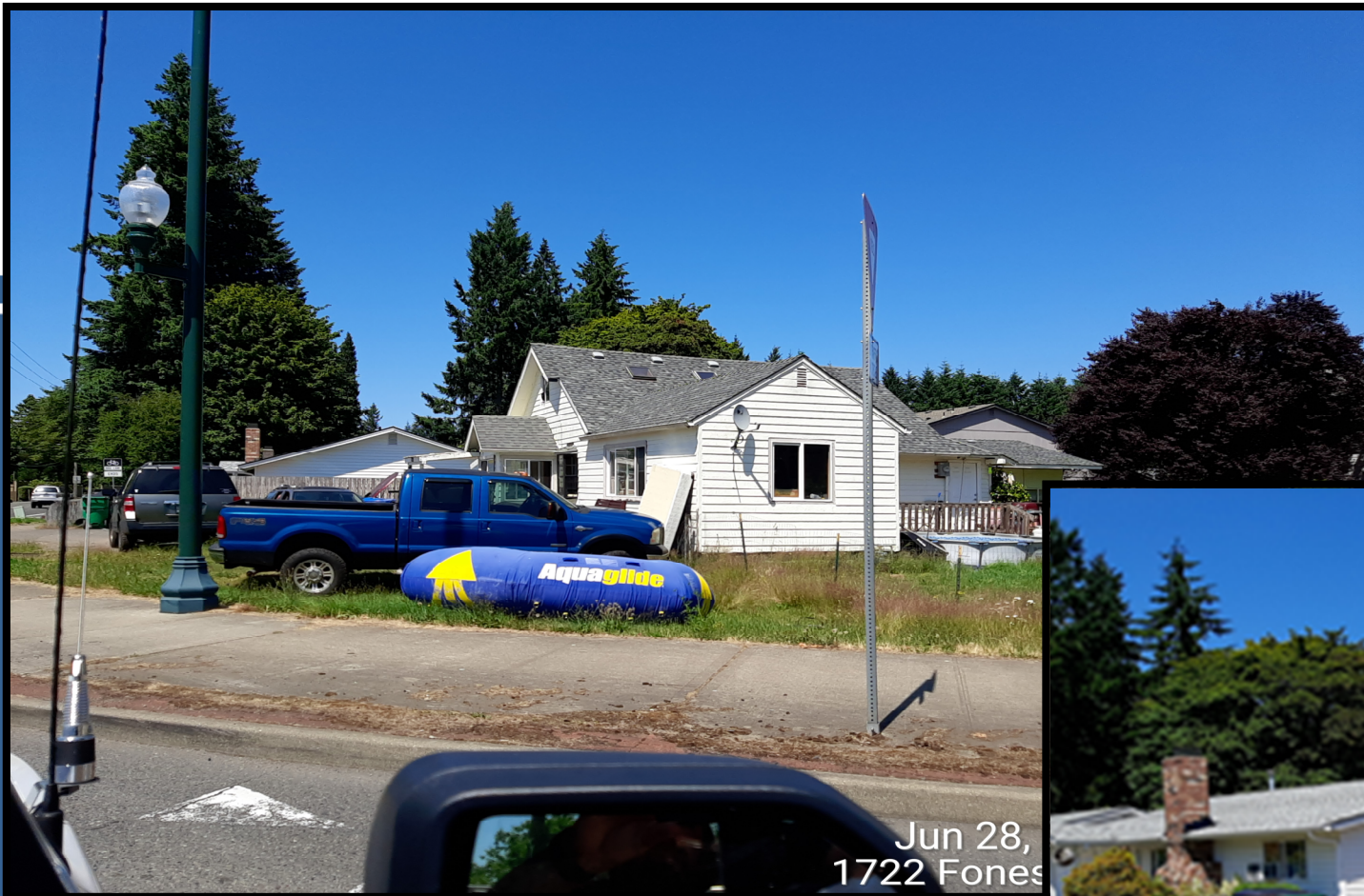
Jun 28, 1722 Fones