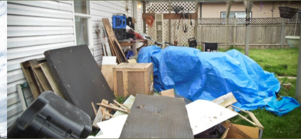
Trash, Garbage & Debris