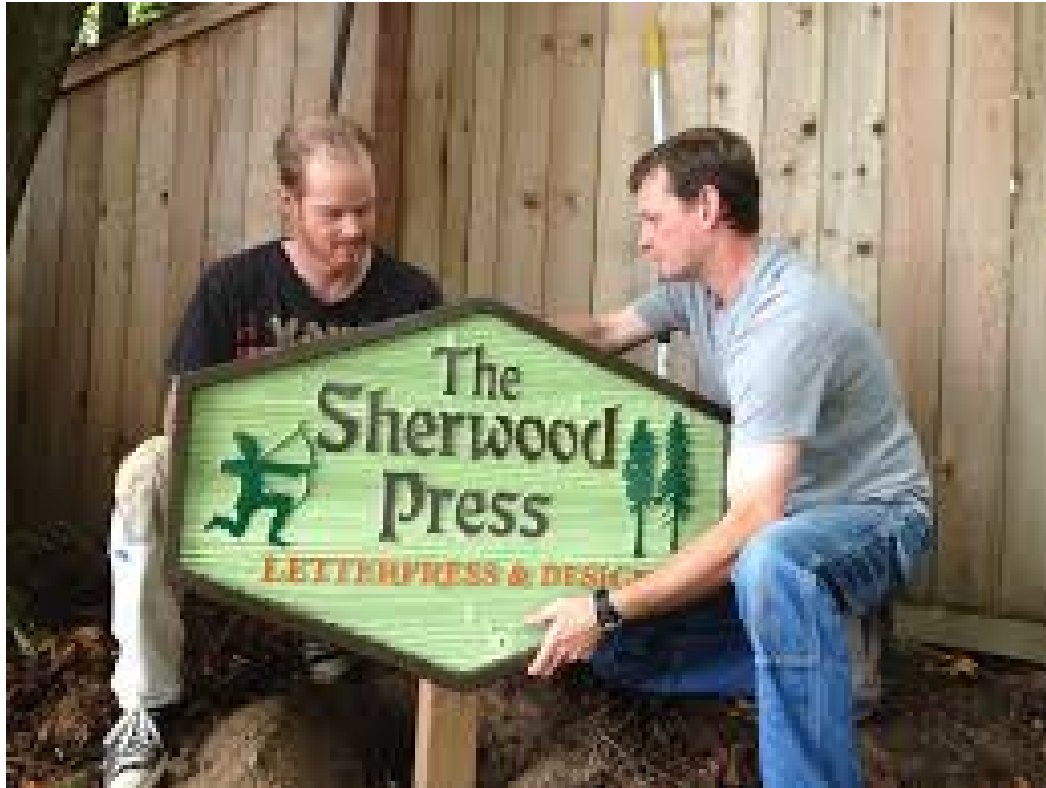
Sign installed at Sherwood Press, on the heritage register in West Olympia