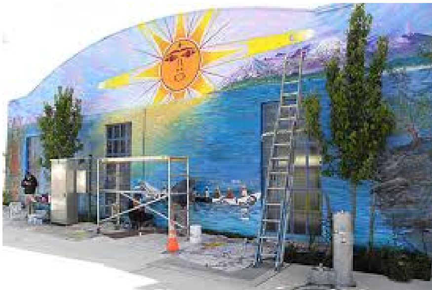
Paddle to Squaxin Mural

Many more examples of his work can be found at his website: http://iracoyne.com/