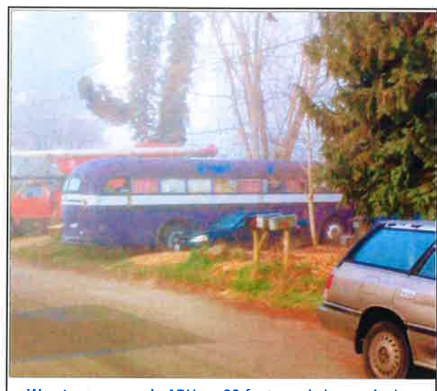
Worst-case-scenario ADU – a 30-foot purple bus parked at 1215 Marion Street NE

PLEASE establish a landlord registry. Because nearly all of the housing created under this proposal will be rental units, it is imperative that landlords be held to enforceable standards of housing quality and allowable behavior in their rental properties. This is crucial to prevent rentals from becoming blights on the neighborhood and ensure that tenants are not living in squalor or endangering nearby homes by engaging in illegal activity. In Olympia's close-in neighborhoods east of downtown, our quality of life has been diminished by notorious slumlords who allow their tenants to live in ill-kept houses that do not have heat or water, which soon turn into flop houses that attract myriad illegal activities.