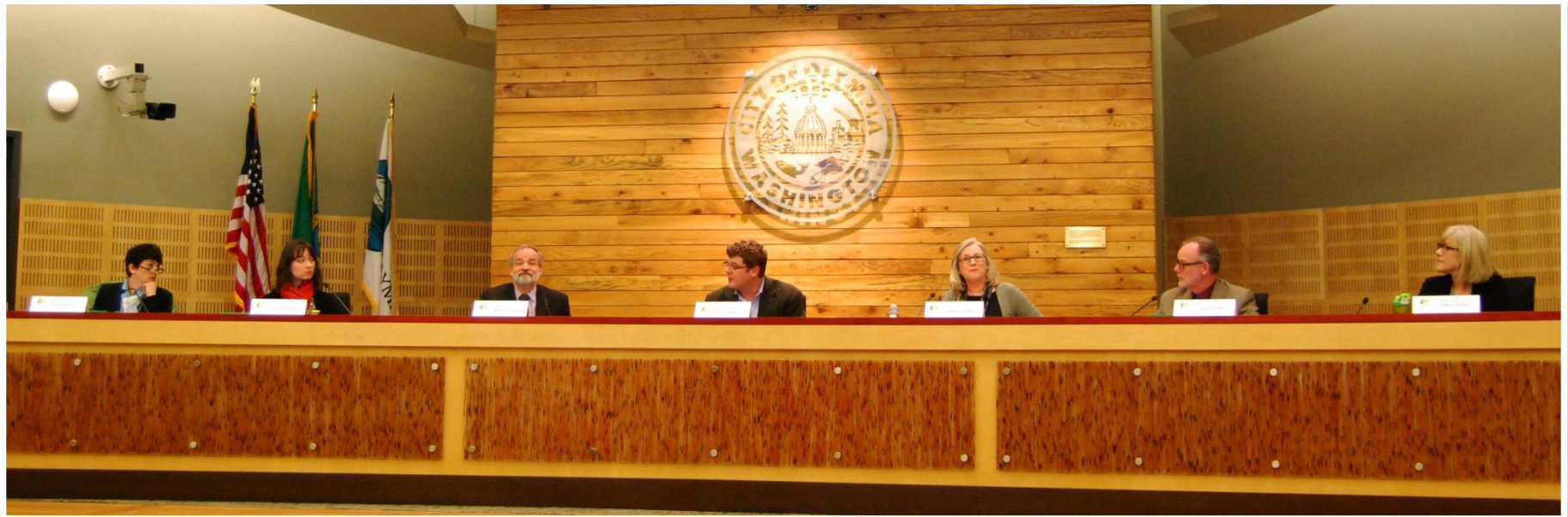
First OMPD Board Meeting – March 1 st , 2016