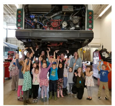
Students touring Intercity Transit.