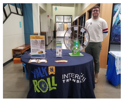
Teaching bike and walk safety.