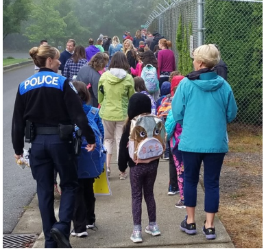
Walk N Roll to School at Hansen.