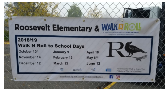
Walk N Roll to School at Roosevelt.