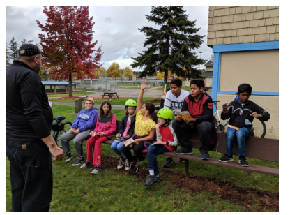
Jefferson Earn-A-Bike students.