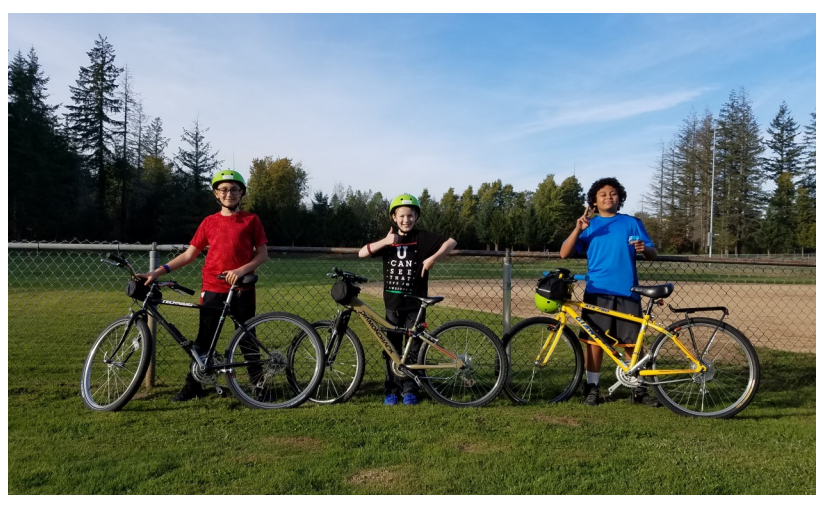
Earn-A-Bike students from Jefferson Middle School.

https://www.intercitytransit.com/walknroll, walknroll@intercitytransit.com