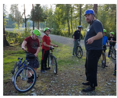
Students learning bike safety skills.