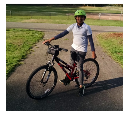
Student with their new bike.