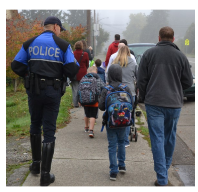
International Walk to School Day.