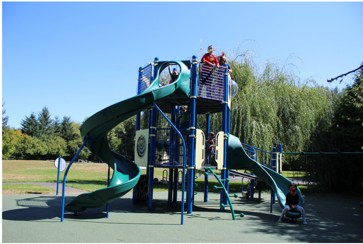
New Playground at Friendly Grove Park