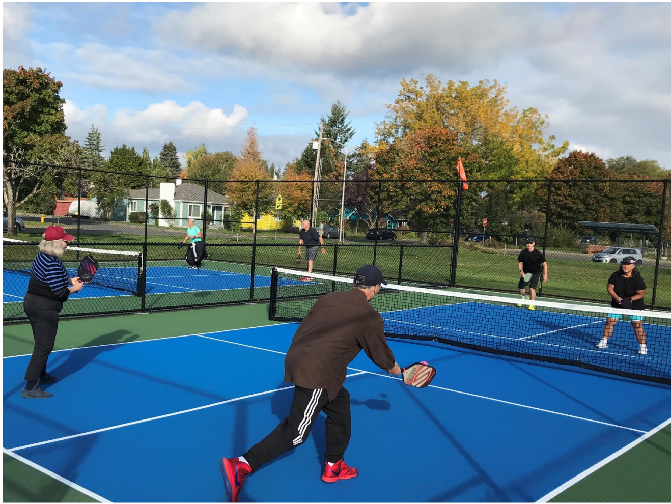
Pickleball Courts at Woodruff Park – 2020 CAMP Project