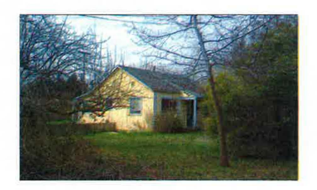
Supplemental information for testimony on proposed 301 Bing St. Apts. Olympia City Council, July 24, 2012.