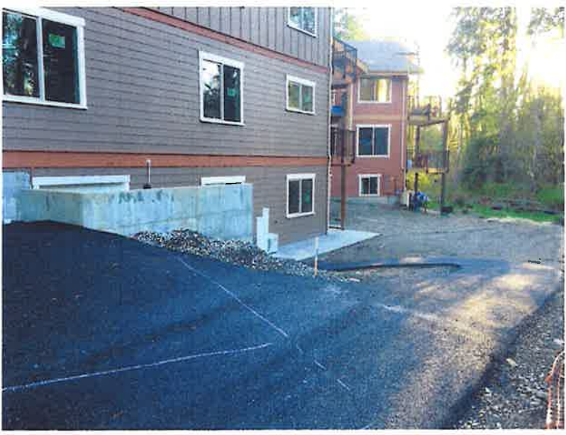
Down bike path toward wall in front of bike storage