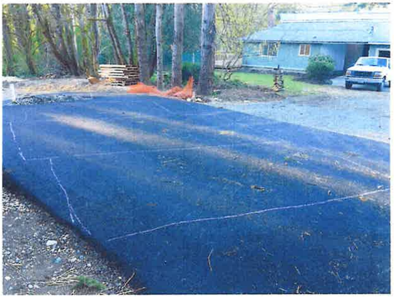
From corner accessible to sidewalk, looking NW