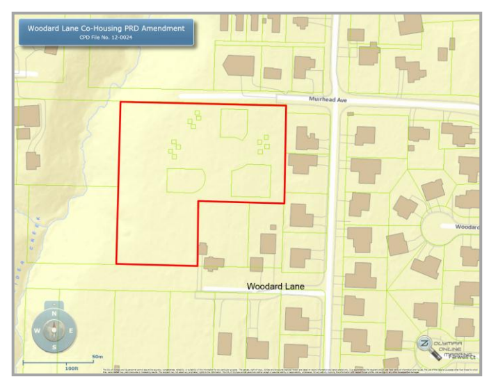
Figure 1: Subject Site. CPD, 2013.

The subject site is zoned Single-Family Residential (R 4-8), and as such it is primarily single family housing that surrounds the site. To the west is the Snyder Creek ravine. Access to the site is taken from Woodard Avenue along the south boundary. Parking spaces for 29 vehicles exist in the southern portion of the site.