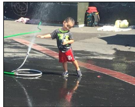
Happy child enjoying the “spritzer” on a hot day - August 26

In conclusion, it was another successful summer of events. In all, the Well Host and Park Ranger trespassed two individuals from the park. While staff was onsite (540 hours), drugs and alcohol use was strictly prohibited and a mutual respect of the space was shared by all.