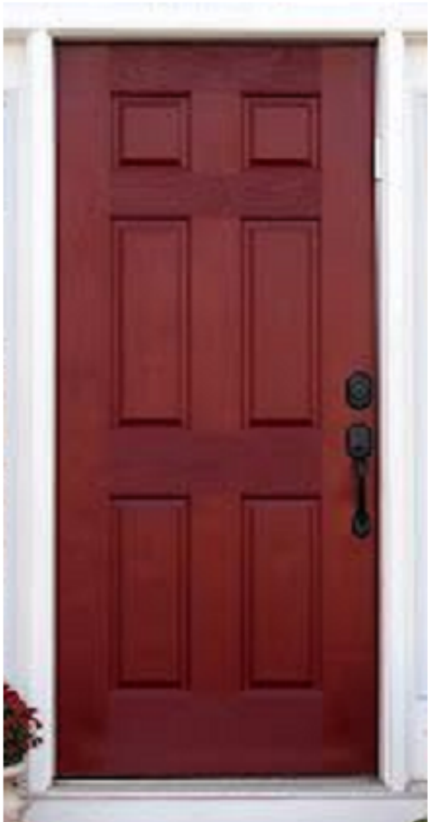
TYPICAL FRONT DOOR SW 6321 RED BAY