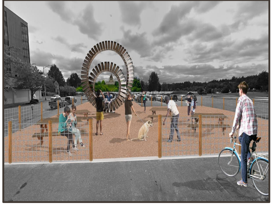
Former County Health Building Site