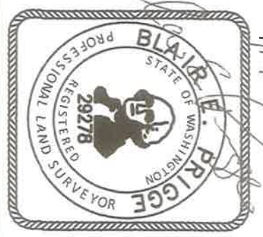
EXHIBIT B ALLEY VACATION JOB NUMBER 17-565 DATE 4/16/2017 SCALE 1"=60'

MTN 2 COAST, LLC PROFESSIONAL LAND SURVEYORS OLYMPIA, WA 360.239.1497