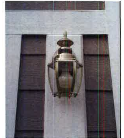
EXTERIOR WALL SCONCE