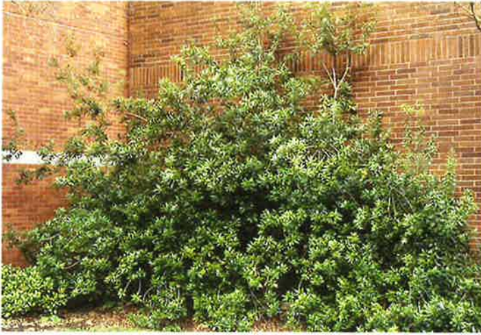
Myrica- Pacific Wax Myrtle