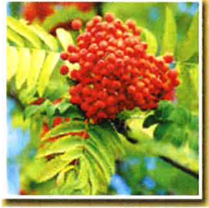
Cardinal Mountain Ash (EAB resistant)