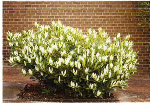
Otto Luyken Laurel