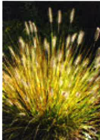
Dwarf Fountain Grass