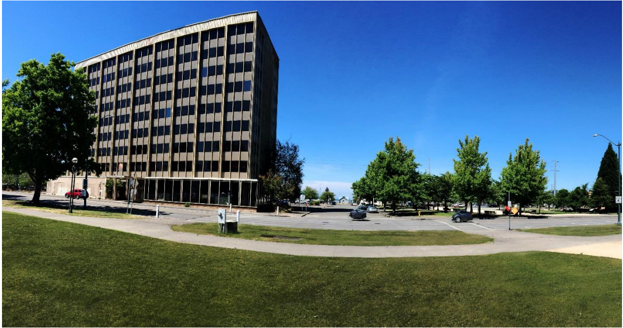
Figure 7 Existing view

VIEW D: View towards the Olympic Mountains from intersection of Sylvester and 5 th looking north toward the Olympia Yacht Club.