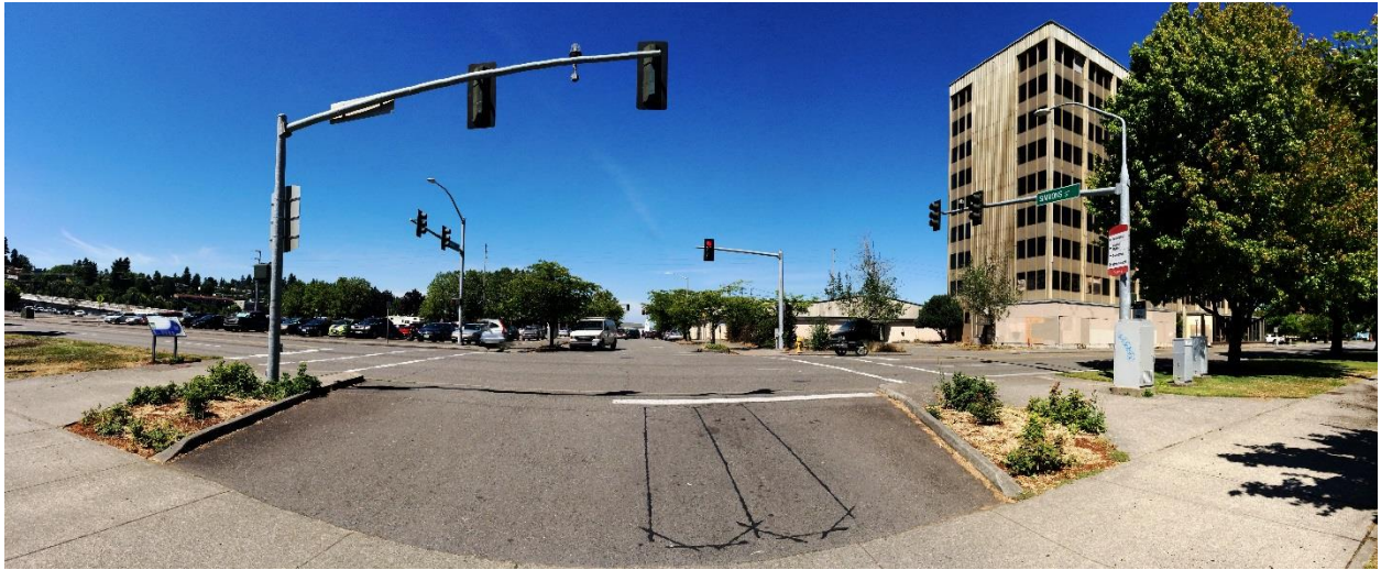
Figure 1 Existing view

VIEW A: View towards Olympic Mountains and Budd Inlet from the intersection of Simmons and 5 th looking north toward Olympia Yacht Club.