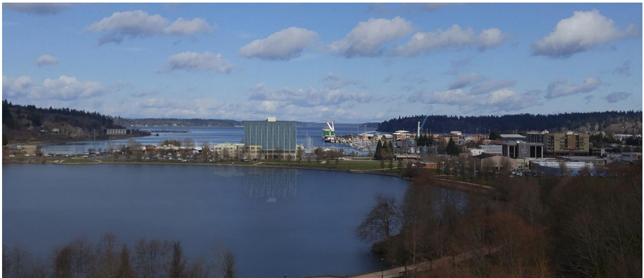
Figure 14 View with project

The existing view is unchanged with the project. Although not an element of view analysis, the new curtain wall façade on the tower structure will include a glazing system to help reflect the natural settings and further blend the existing tower with the water and sky.