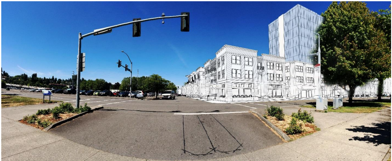
Figure 2 View with project

To the extent weather permits visibility of the Olympics from this point, the existing view is unchanged with the project. View along the right-of-way will remain unobstructed, and the existing one-story building and associated street trees currently block remaining views to the northeast. Although not an element of view analysis, the new curtain wall façade on the tower structure will include a glazing system to help reflect the natural settings and further blend the existing tower with the sky.