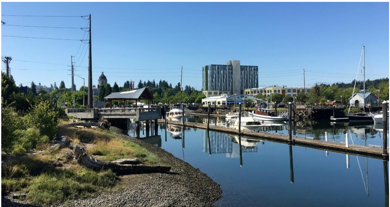
Figure 12 View with project

The existing view is unchanged with the project. The view of the Capitol Building is unchanged, with the dome clearly visible to the same extent it is now. The tops of the new three story buildings are partially visible within the street trees.