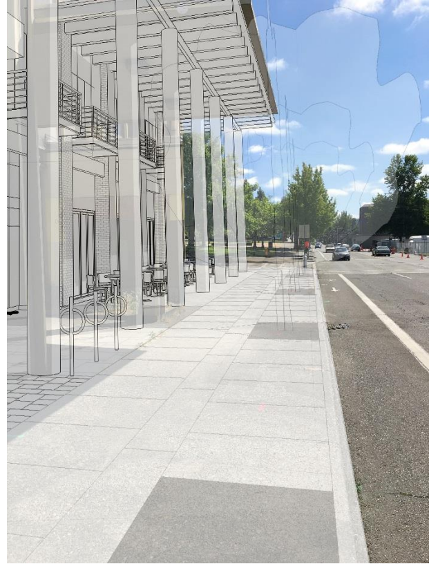
Figure 10 View with project

New view looking east along the southern building façade of the tower building opens up the view around the corner to the Heritage Fountain Park, and creates additional pedestrian space and outdoor eating space along 5 th Avenue. New street trees to be provided along 5 th not shown for clarity.