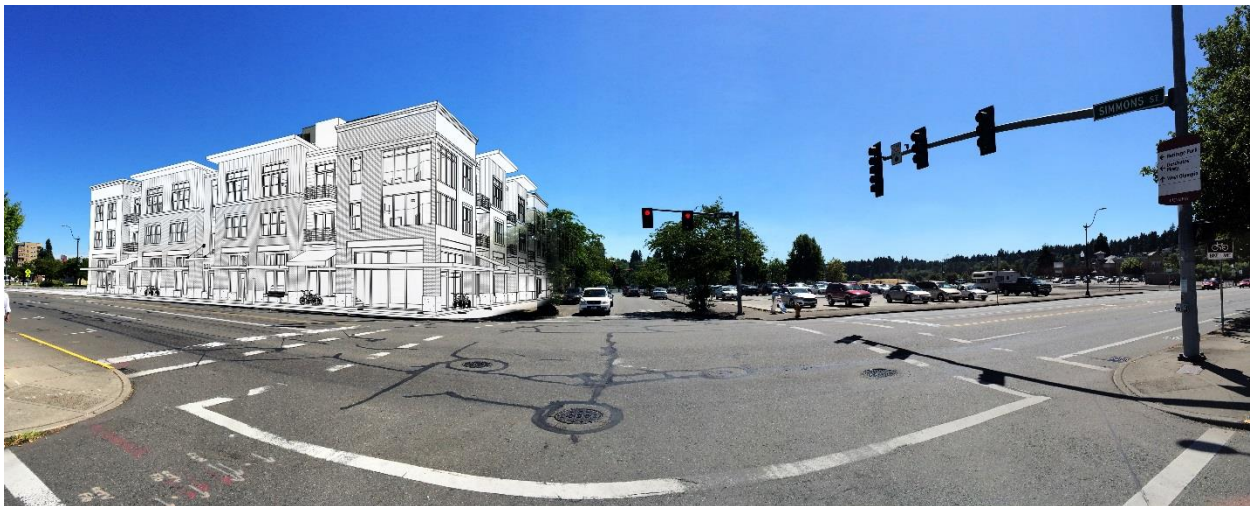
Figure 4 View with project

The existing view is unchanged with the project. Capitol Lake is not currently visible from the public right-of-way, and will remain so. View along the right-of-way will remain unobstructed. The view of the Capitol Building is unchanged, with the dome clearly visible to the same extent it is now. The one-story building and associated street trees currently block the view of the hillside below the Capitol Building to the south. This will remain unchanged with the project.