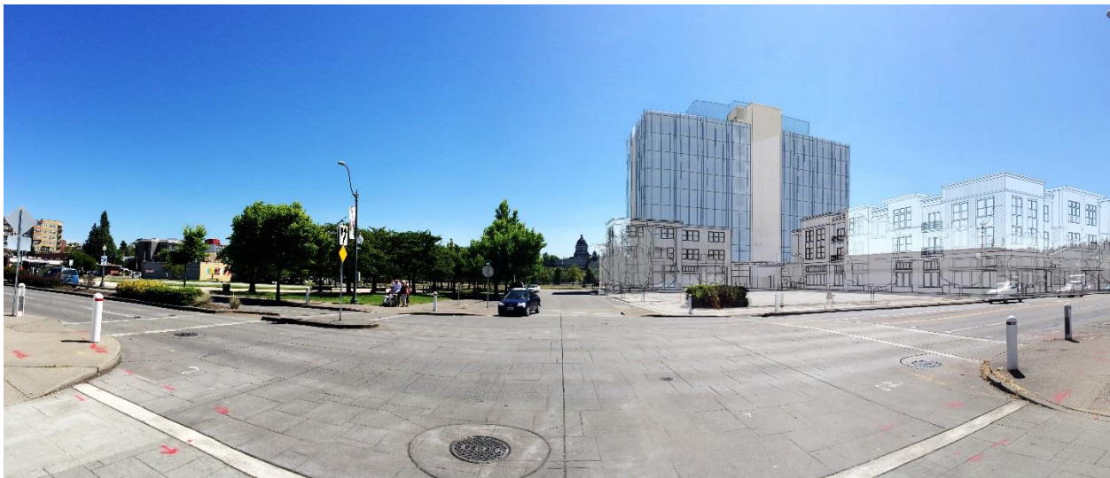
Figure 6 View with project

Capitol Lake is not currently visible from this viewpoint. View of the Capitol Building dome from the right-of-way will remain unobstructed, as it is now. The view of the lower right-hand portion of the Capitol Building and associated hillside from this point will be partially obscured by the new three-story building; however, that view is currently partially obscured by street trees. In addition to maintaining existing views, the project will provide enhanced opportunity for public viewing of Capitol Lake, the Capitol Building, and associated hillside from the proposed restaurant and public plaza located on the corner of Sylvester and 5 th Ave.