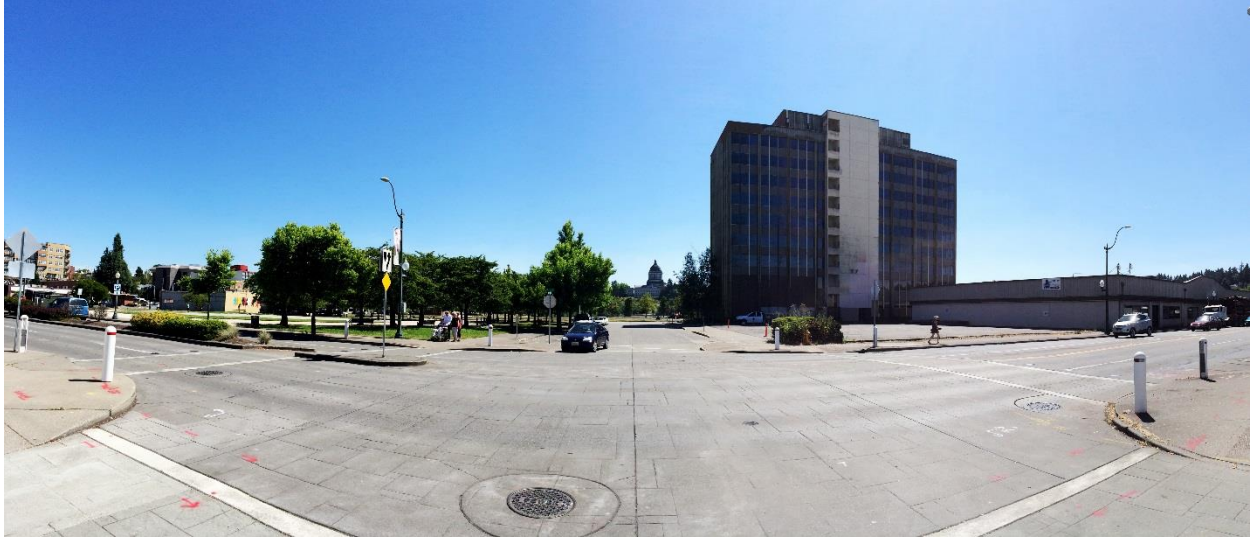
Figure 5 Existing view

VIEW C: View towards Capitol Lake and Capitol Building from intersection of Sylvester and 4 th .