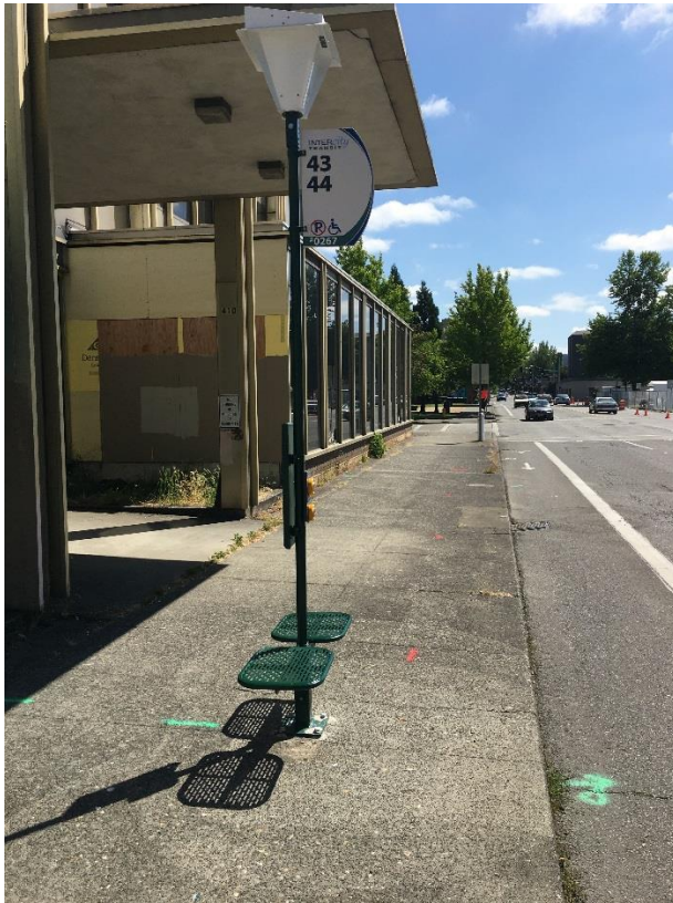
Figure 9 Existing view

VIEW E: View east towards south end of Heritage Park Fountain from sidewalk.