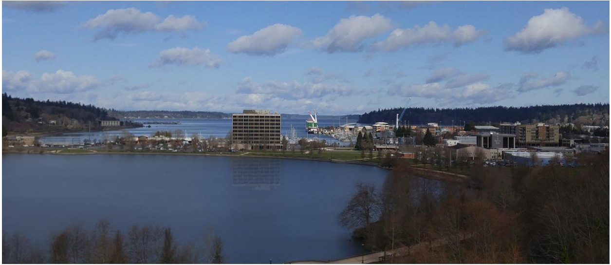
Figure 13 Existing view