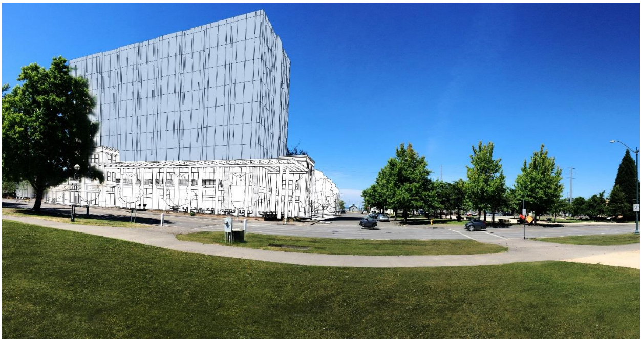
Figure 8 View with project

To the extent weather permits visibility of the Olympics from this view point, the existing view is unchanged with the project. View along the right-of-way will remain unobstructed, and the existing buildings and street trees currently block remaining views. Although not an element of view analysis, the new curtain wall façade on the tower structure will include a glazing system to help reflect the natural settings and further blend the existing tower with the sky.