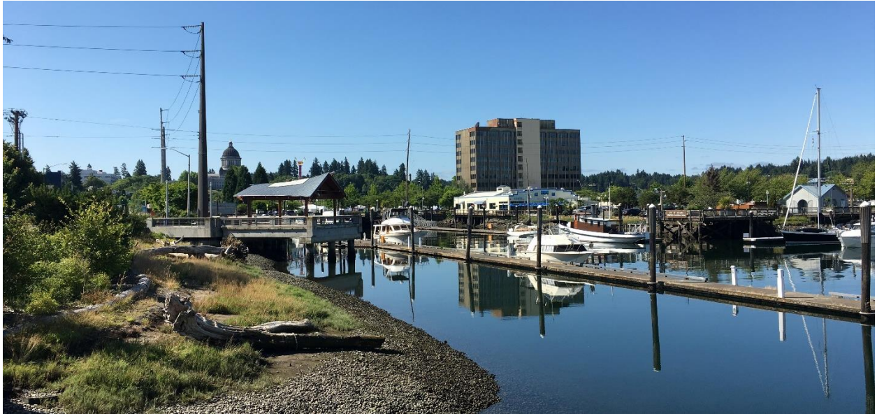
Figure 11 Existing view