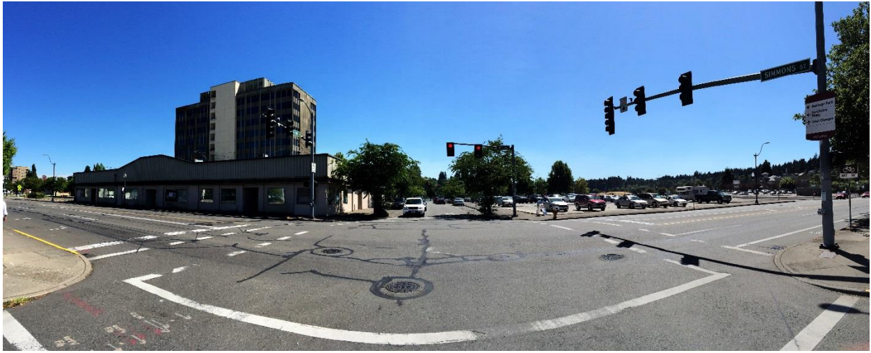
Figure 3 Existing view

VIEW B: View towards Capitol Lake and Capitol Building from the intersection of Simmons and 4 th looking south.