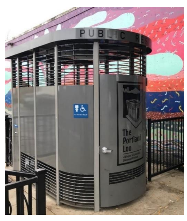
The Portland Loo was installed at the Artesian Commons Park, providing a public restroom open 24/7.

Public Restroom Facility CDBG invested $97,102 to purchase a public restroom equipment – a pre-fabricated restroom facility. The facility was installed in the Artesian Commons Park located in Olympia's downtown core. This public facility is available to all members of the public, however the primary beneficiaries are homeless, mentally ill and other street dependent people who have limited daytime access to restrooms during the day and zero access overnight.