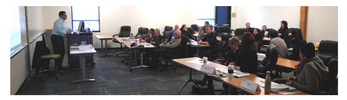
"Tune-Up" Business Training the Thurston Economic Development Council (TEDC) provided business training & technical assistance for 41 Olympia-based businesses. CDBG Funds allocated: $25,864, CDBG funds expended: $18,489.73.

Economic Development: Small Business Training and Technical Assistance CDBG funded $25,864* to the Thurston Economic Development Council to provide "tune-up" training for existing small businesses. This program assisted 41 Olympia businesses and produced one job for a low-moderate income individual. An additional $18,953 in funded to Enterprise for Equity to provide "start-up" micro-enterprise training to low/mod income entrepreneurs. Twelve low-moderate income individuals benefited from this program.