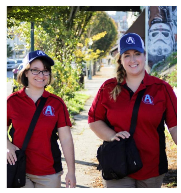
The Downtown Ambassadors provide street outreach assistance and referrals to homeless, mentally ill and other street dependent people in the urban hub

Downtown Ambassador Program CDBG funds provided $55,397 for street outreach activities. This team provides services and referrals to 2,636 homeless, mentally ill and street dependent people. This program is paired with the City-funded Downtown Clean Team that provides downtown clean-up services, including the removal of human waste generated by homeless people without access to public restrooms ( See above ).