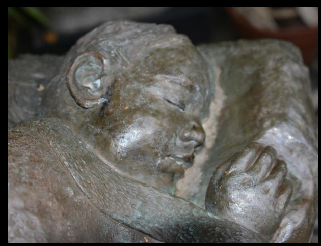
Vision of Sugar Plums by Jim Johnson, Salem, OR 36"x 16"x 16" | Bronze