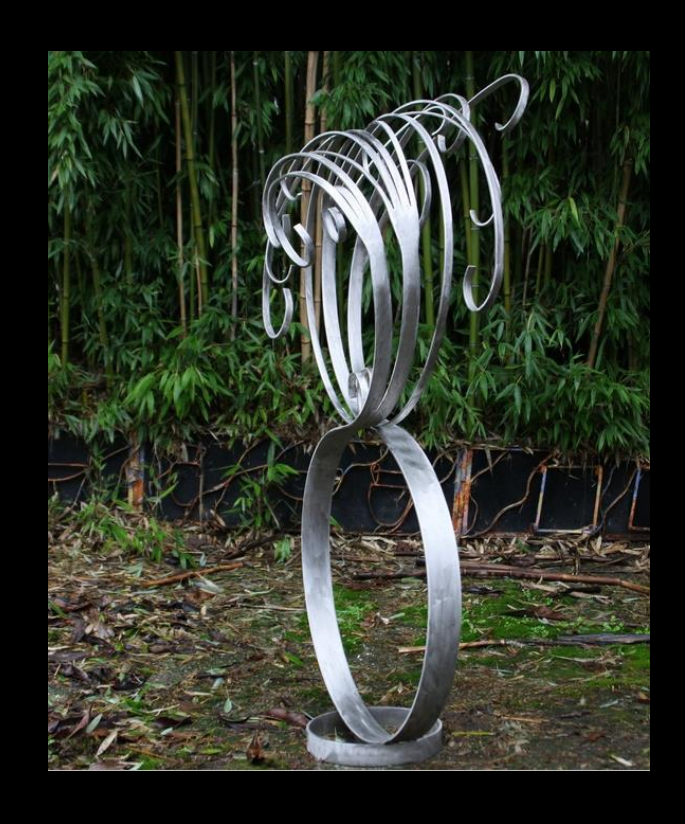
Fiddlehead by Ken Turner, Seattle, WA 65"x34"x24" | Stainless Steel