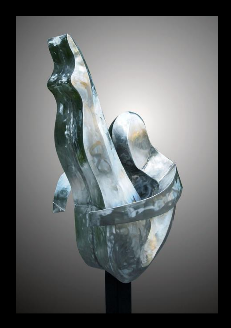
Diver by Kevin Au, Mercer Island, WA 74"x27"x26" | Stainless Steel