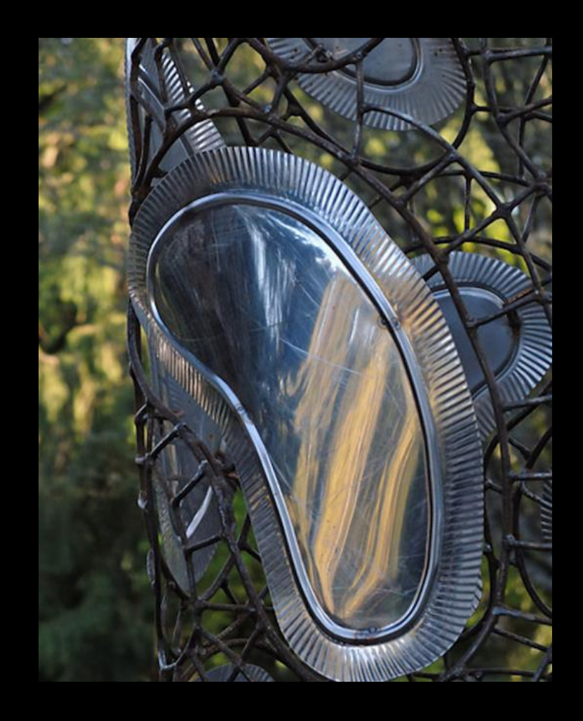
Pier 56-Garden by Roger Squirrell, Lake Forest Park, WA 96"x20"x20" | Stainless & Mild Steel