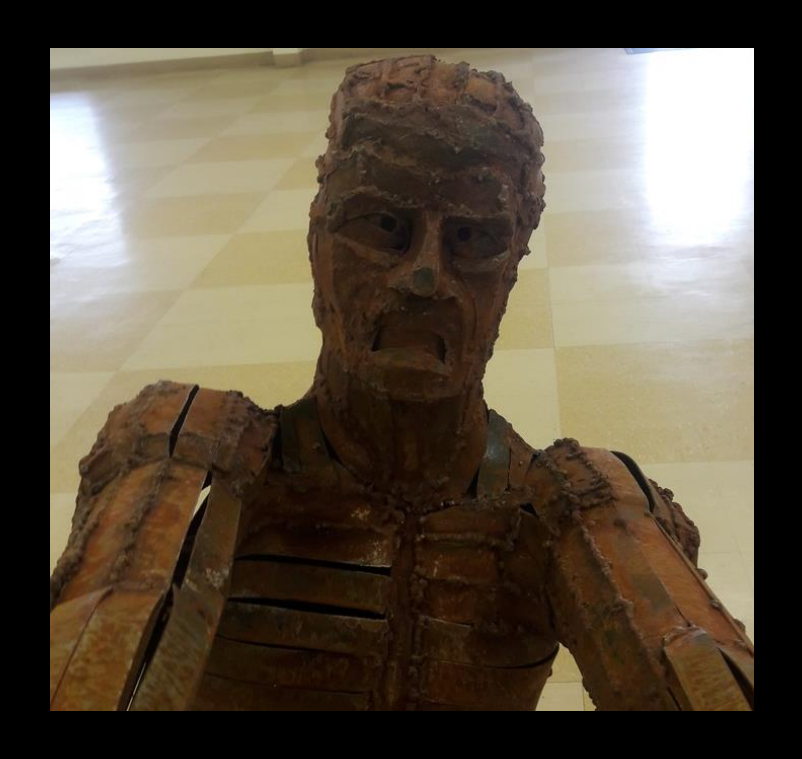
Hot Wheels by Kevin Mahaffey, Poulsbo, WA 46"x48"x60" | Welded Steel