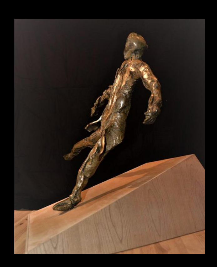
OOPS !! by Tim Duffy, Shelton, WA 36"x22"x16" | Bronze