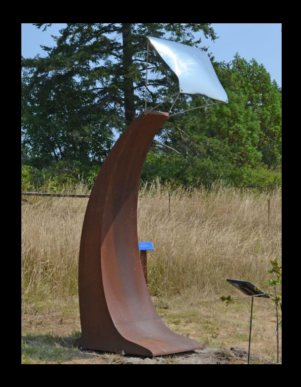
Cosmic Sail by Bill Wentworth, Poulsbo, WA 10'x3'x4.5' | Stainless Steel, CorTen Steel