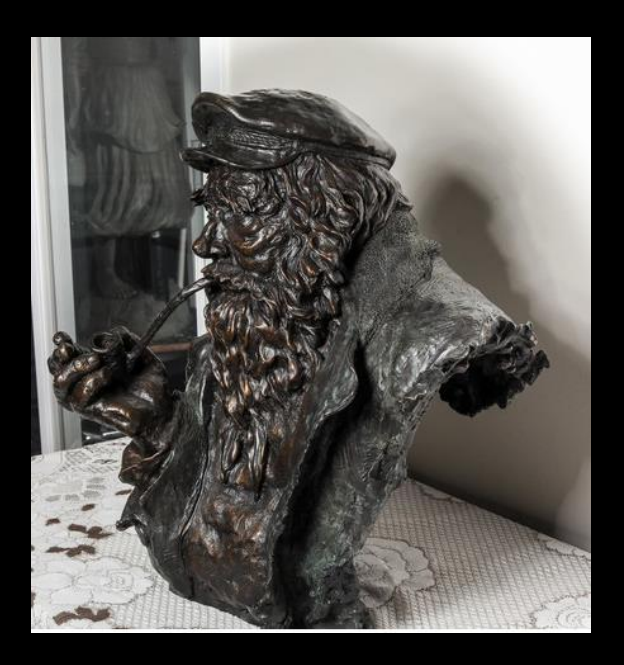
Old Man of The Sea #2 by Sandra Hays, University Place, WA 29"x28"x22" | Bronze