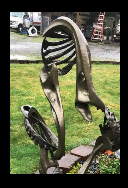
From The Sea by Hugh Buchholz, Olympia, WA 48"x14"x14" | Silicon Bronze