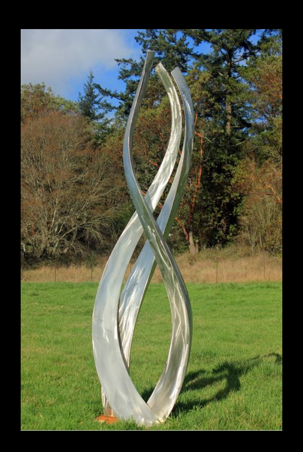
Sea Grass by Micajah Bienvenu, Harbor, WA 104"x36"x36" | Stainless Steel