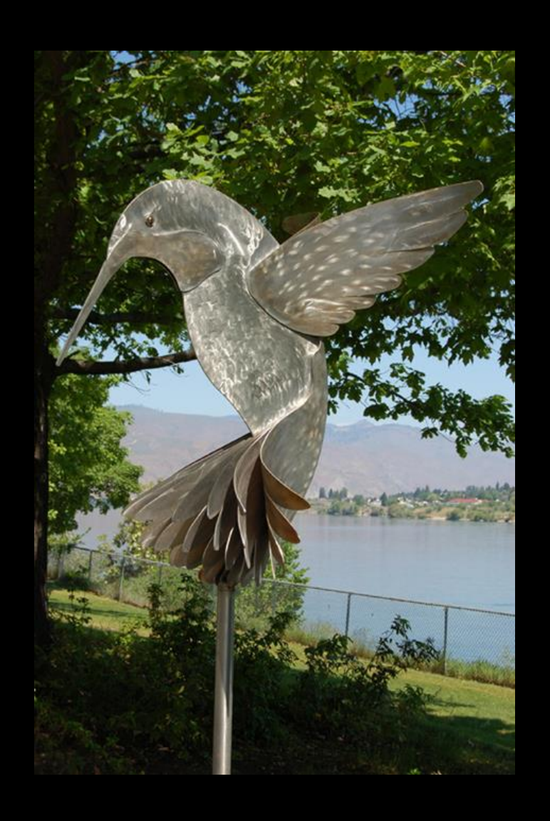
Hummingbird I, by Charles Fitzgerald, Puyallup, WA 10'x3'x3' | Stainless steel-Aluminum