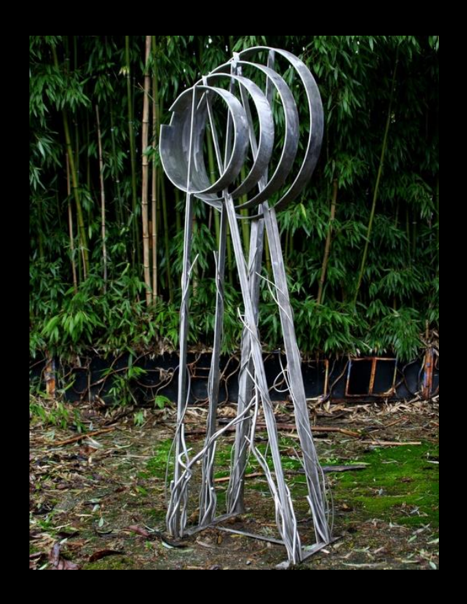
Two Aspects of Time by Ken Turner, Seattle, WA 80"x28"x20" | Stainless Steel