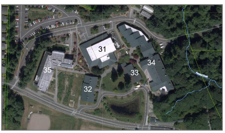
Figure 2: Aerial View of Buildings 31-35. ZOOM V 1.0. C.McCoy.

meeting is a public meeting and as such public testimony or comments are not accepted, however the Board will accept written comments submitted in advance of the meeting.