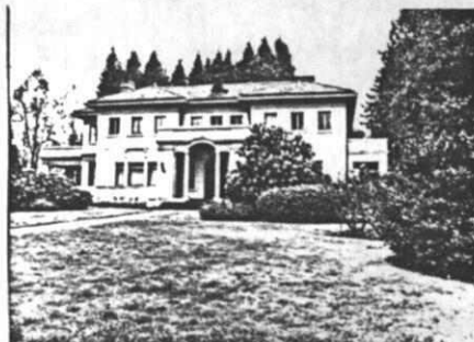
34-18-4 North facade (View from the North) December 1980 J.H. Vandermeer