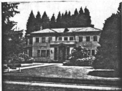
34-M-1 North facade (view from the N)

THURSTON COUNTY: South Capitol Historic District : A Lord Mansion, April 1980