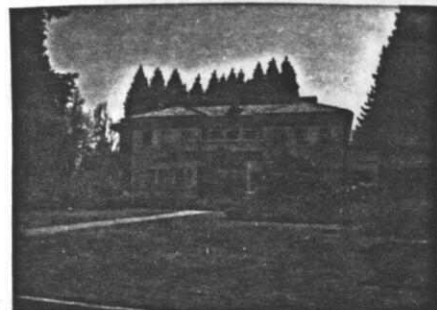
34-M-3 North facade (View from the N)