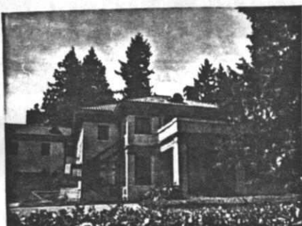
34-M-2 East facade (View from the E)