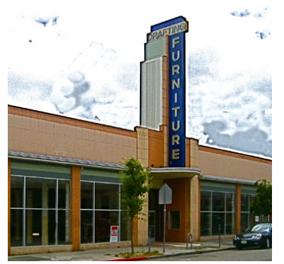
Sign on Architectural Feature