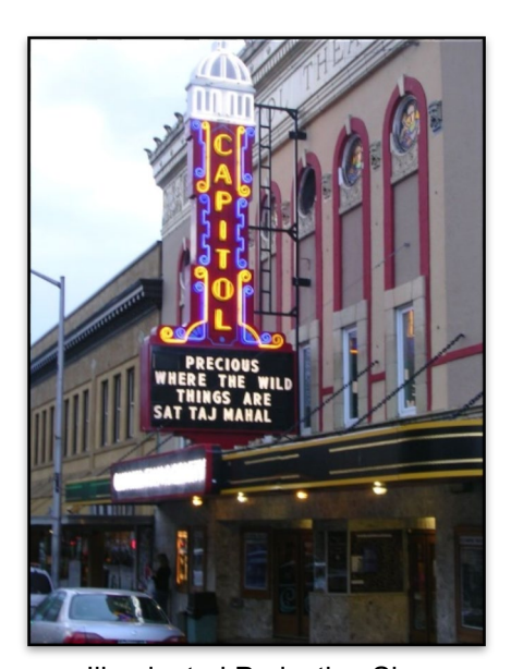
Illuminated Projecting Sign