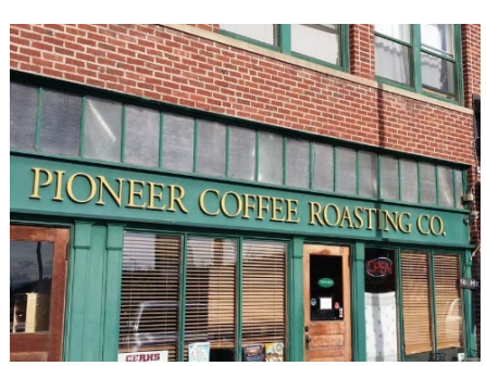
Sign in Sign Band