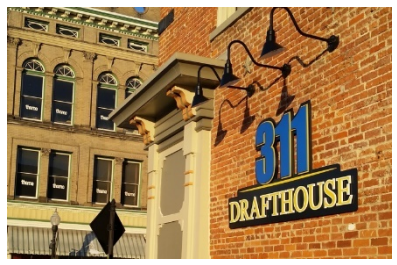
Sign with External Lighting