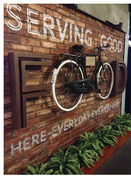
Creative Metal and Paint Sign