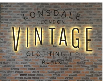
Halo Effect Signage Lighting