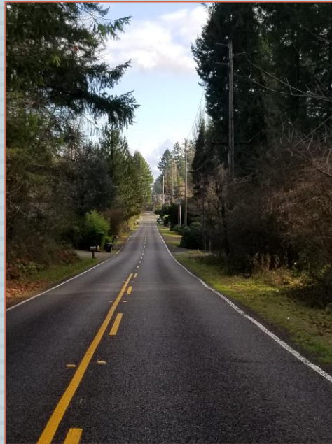
Looking east towards Bing Street