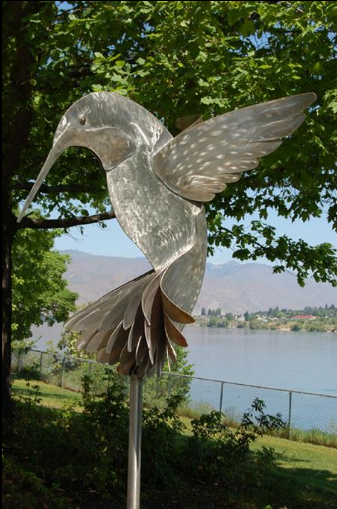
Hummingbird I, by Charles Fitzgerald, Puyallup, WA 10'x3'x3' | Stainless steel-Aluminum