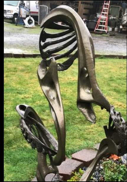
From The Sea by Hugh Buchholz, Olympia, WA 48"x14"x14" | Silicon Bronze