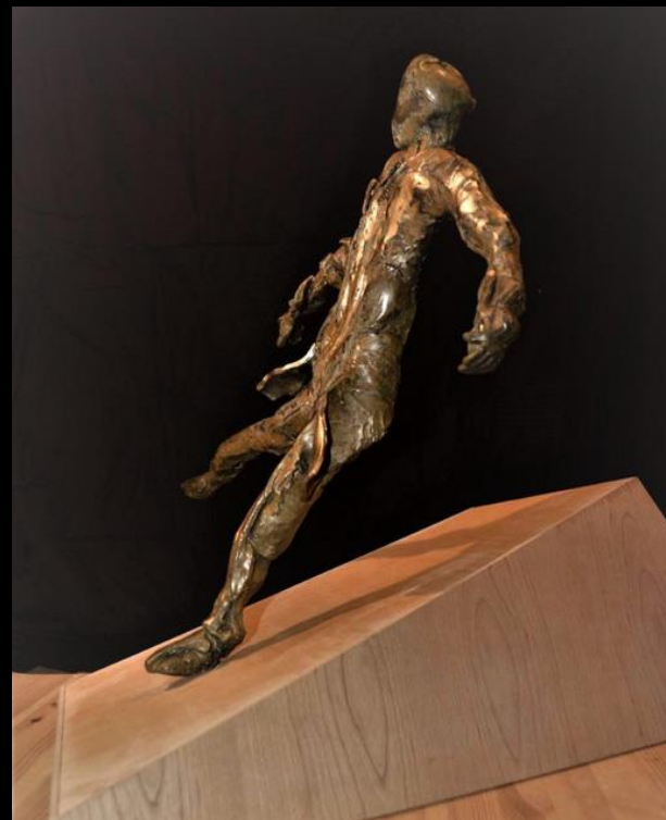
OOPS !! by Tim Duffy, Shelton, WA 36"x22"x16" | Bronze