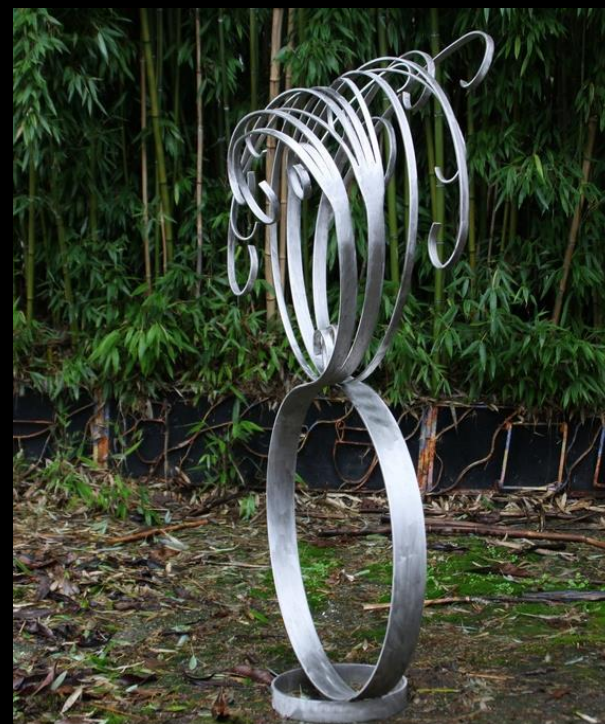
Fiddlehead by Ken Turner, Seattle, WA 65"x34"x24" | Stainless Steel