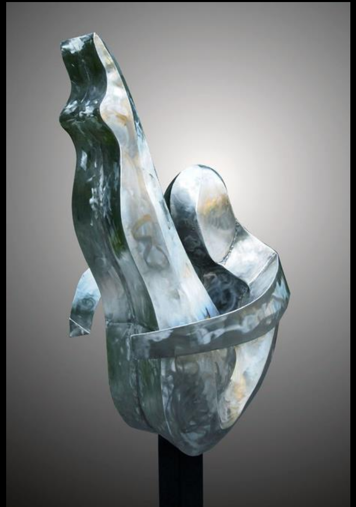
Diver by Kevin Au, Mercer Island, WA 74"x27"x26" | Stainless Steel