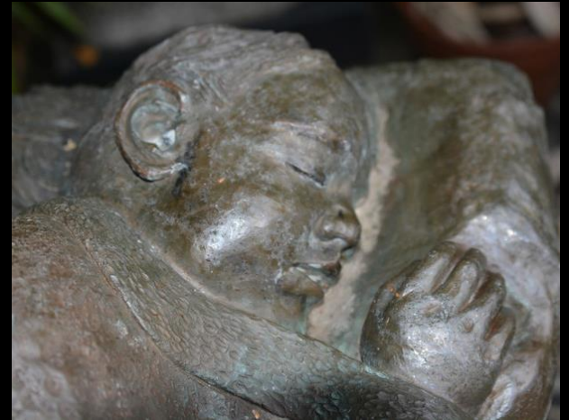
Vision of Sugar Plums by Jim Johnson, Salem, OR 36"x 16"x 16" | Bronze