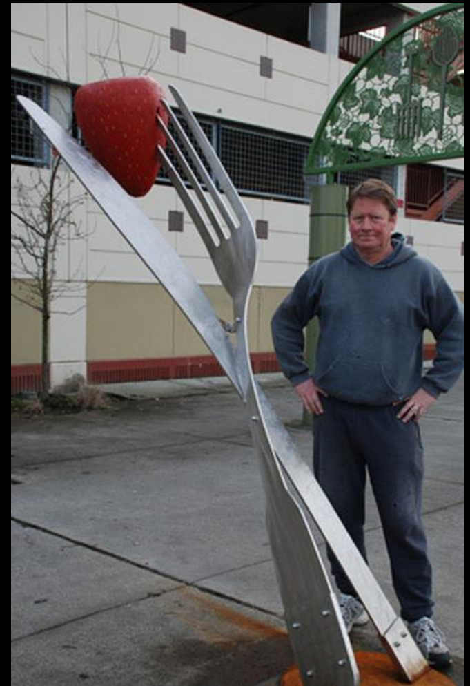
aaastrawberry by Charles Fitzgerald, Puyallup, WA 74"x24"x24" | Stainless steel & Polyurea