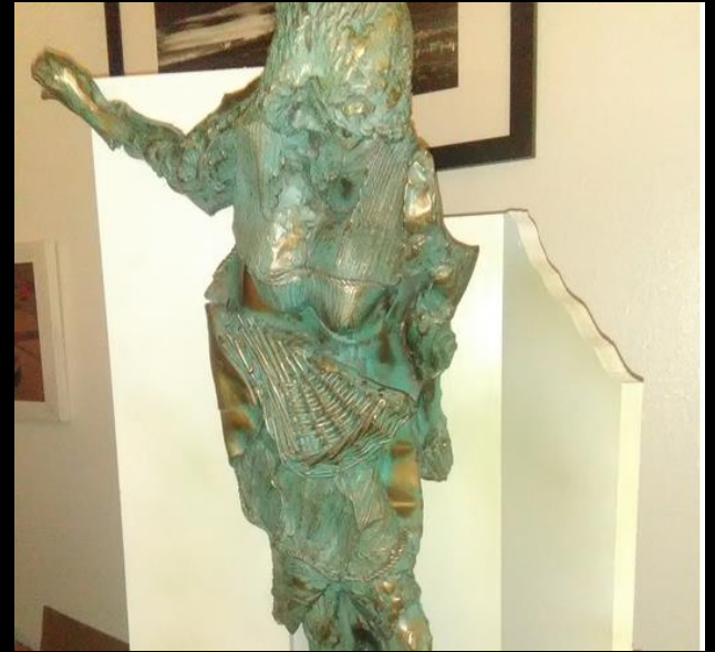
The Lady of The Harbor-Shellfish at Lowtide by Tim Duffy, Shelton, WA 36"x22"x8" | Bronze