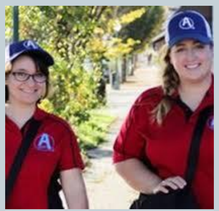
DOWNTOWN AMBASSADORS PROVIDE STREET OUTREACH TO STREET DEPENDENT PEOPLE