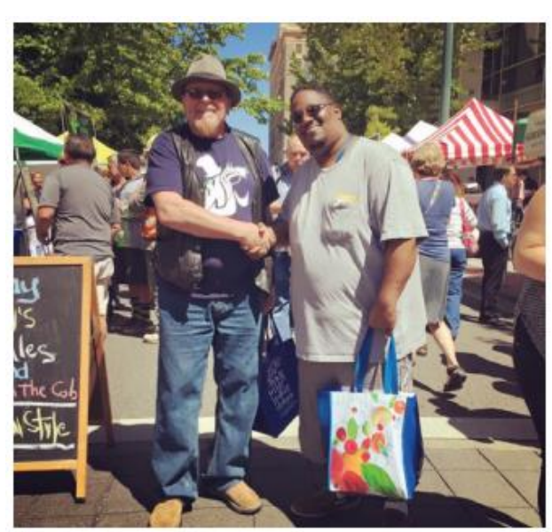
Participants in the SNAP Ambassadors program, Tacoma Farmers Market.