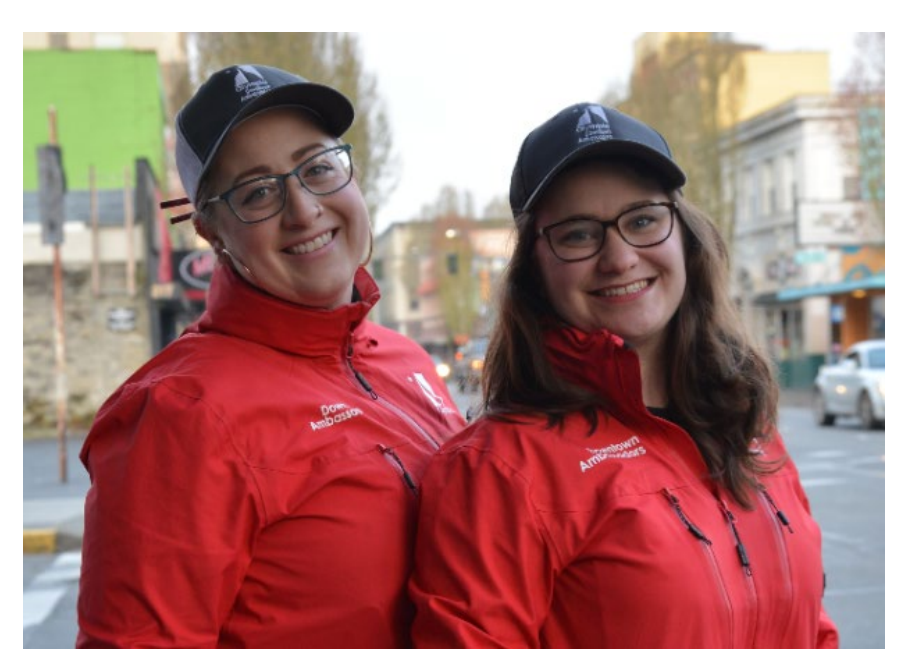
Downtown Ambassadors assist street dependent homeless and mentally ill people.

The City funded the Downtown Ambassador Program, first through the Capital Recovery Center, then bringing the program in-house. This team provided services and referrals on 3,414 occasions for homeless, mentally ill and street dependent people in Olympia's urban hub. This program is paired with the City-funded Downtown Clean Team that provides downtown clean-up services. The City allocated $55,000 and expended $52,089.07 in CDBG funds.