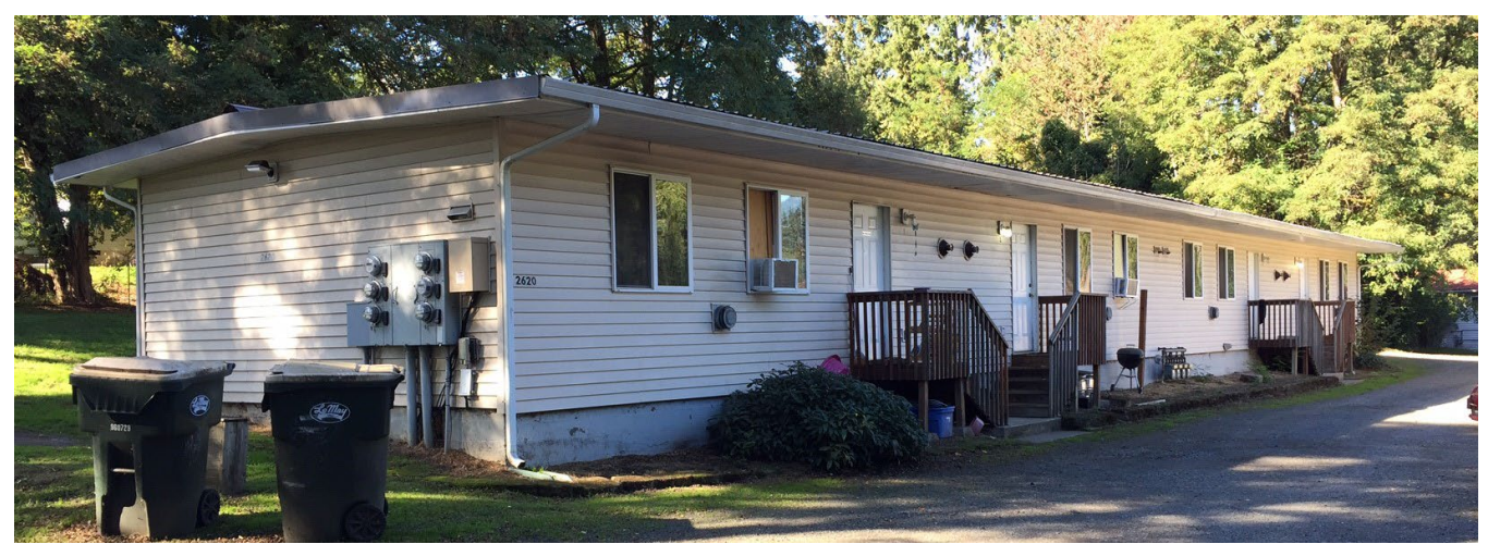
McGee Trust 6-Plex received CDBG funds to convert from a failed septic system to a sewer connection.

Candlewood Manor – Water Connection Repairs Over 100 homes for very low-income residents were preserved with CDBG-funded repairs to their water system. Candlewood Manor was at risk of closure due to non-compliance with State regulations on water safety. A full water system replacement would have cost well over $1,500,000. Instead, Candlewood Manor worked with a local contractor and the State permitting officials to develop a safe but far less costly repair. The City allocated a total of $65,000 and expended $12,356.66 in CDBG funds.