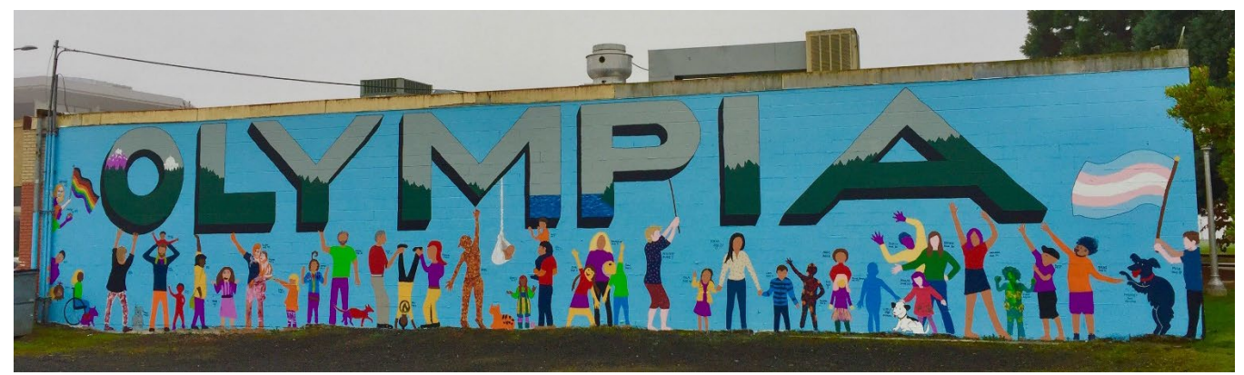
A recently completed mural titled " Holding Up Olympia ", by artist Chelsea Baker and friends of all ages, exemplifies the broad community development goals of the Olympia CDBG Program.

The Council has already developed the next Five-year Consolidated Planning period (2018 – 2022) with new CDBG-eligible strategic goals based on current conditions. That Consolidated Plan can be viewed at Olympiawa.gov/CDBG.