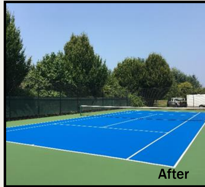
2017 Friendly Grove Tennis Court resurfacing – CAMP Project funded by OMPD