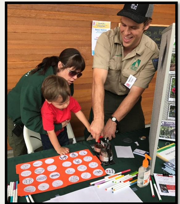
Park Stewardship Program

November 13 OMPD Board Meeting Adopt Budget