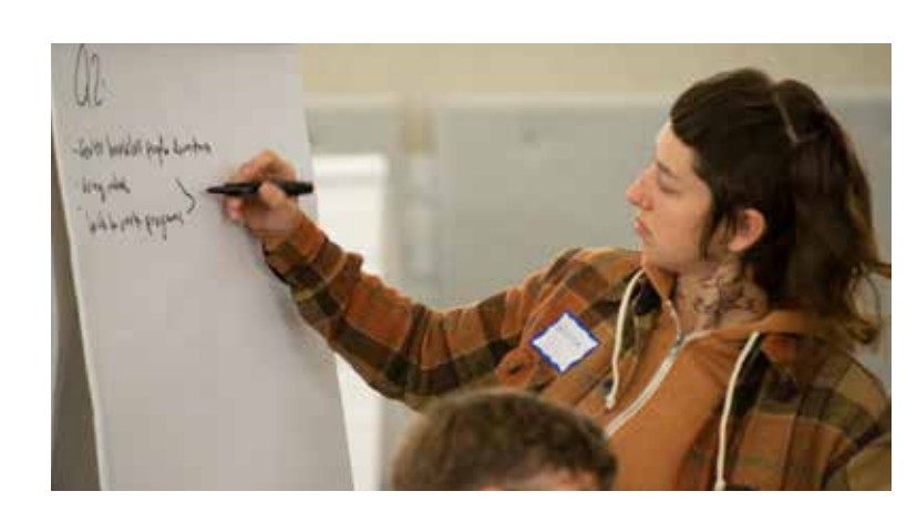
Participants discuss the workshop questions and record their answers.