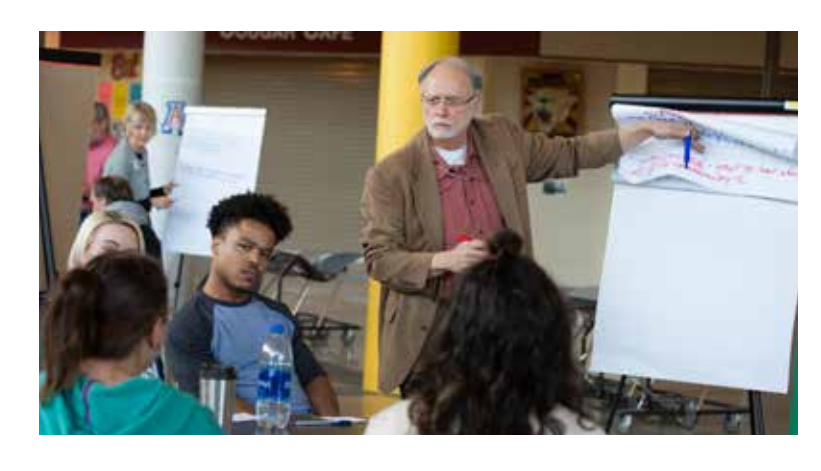
Participants discuss the workshop questions and record their answers.