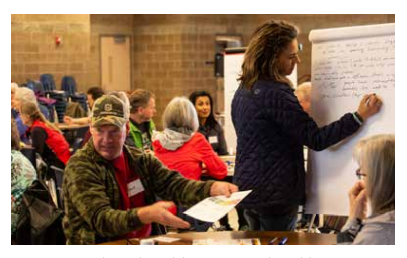
Participants discuss the workshop questions and record their answers.