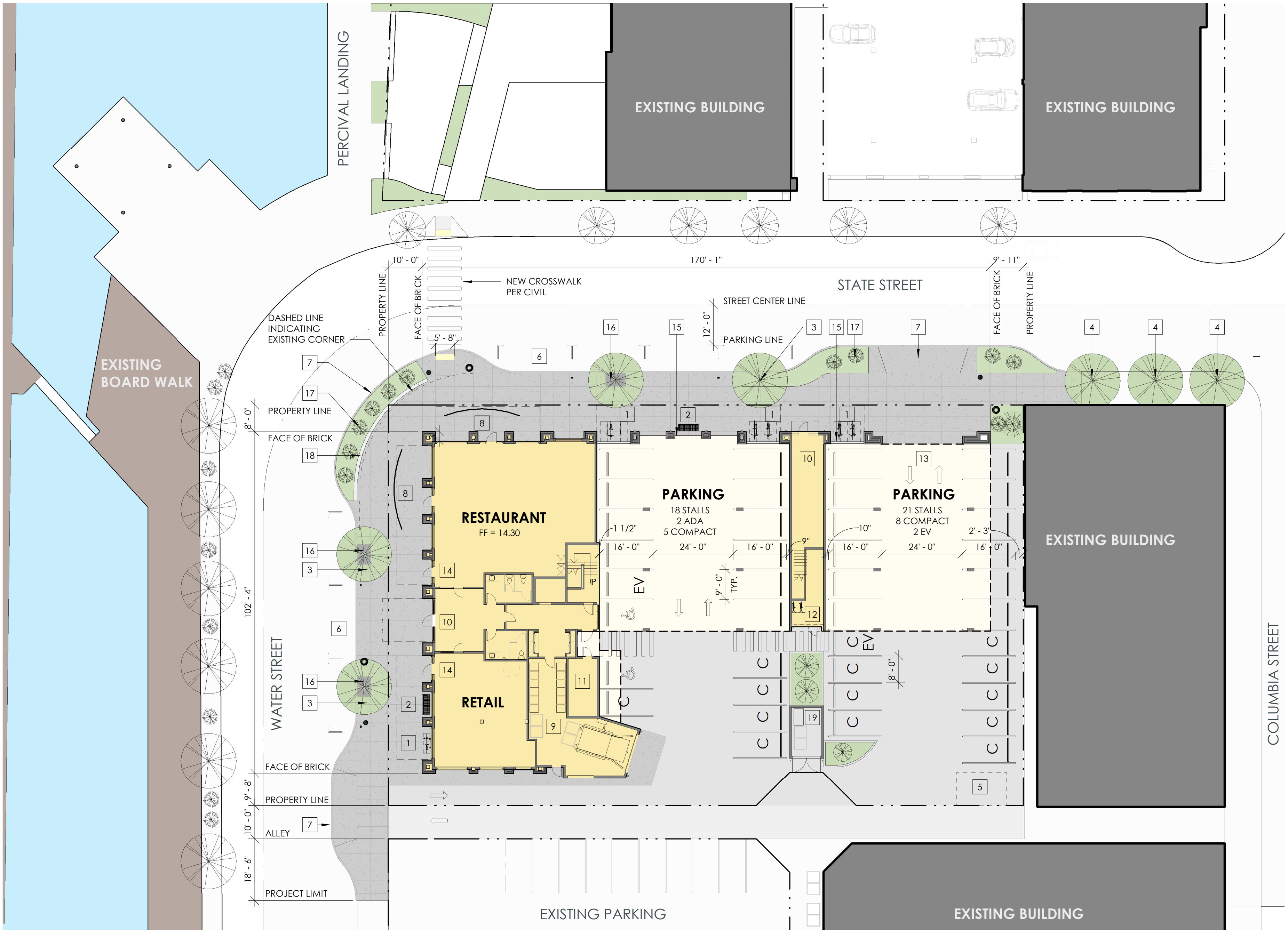
1 SITE PLAN

GENERAL RECYCLING CONTAINERS = 95 GALLONS (202 GALLONS/CY) 5.5 CY REQUIRED X 202 GALLONS/CY= 1,111 GALLONS 1,111 TOTAL GALLONS/95 GALLON CART = 11.7 CARTS REQUIRED 12 95 GALLON CARTS PROVIDED > 11.7 REQUIRED = OK