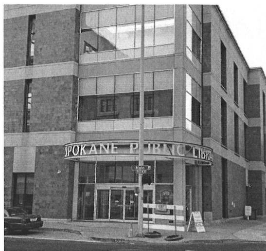
Spokane's Downtown Community Court convenes in the local public library.

Community Court serves the city's central business district, operating out of a public library in an effort to better reach the low-level repeat defendants by connecting them to services in a friendly setting. Spokane Community Courts recognize that low level, non-violent offenses impact both individuals and the community at large. If not addressed, quality-of-life crimes can erode community order, lead to neighborhood decay, and create an atmosphere where more serious crime can flourish. Community Court endeavors to hold participants accountable, address factors impacting participants' criminal behavior, provide access to local resources, address victim needs, and increase public confidence in the criminal justice system. The model proved so successful that, in 2017, with support from the Community Court Grant Program, the Municipal Court opened a second community court in Spokane's Northeast Community Court in an existing community center.