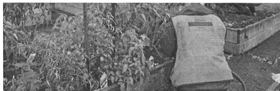
Participants at work in a community garden in Olympia.

life offenses committed in the downtown core. Since its launch, the community court has expanded access to services by repurposing a formerly vacant building steps away from the courthouse, and increased data collection and analysis. Early social service links, including on-site mental health and drug and alcohol evaluations, have been key components to the success of the court. Graduates are invited back to volunteer and/or provide mentor support to participants. A community court garden provides community service opportunities and provides food for participants and local food banks.