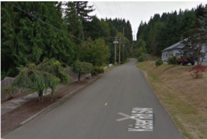
▲ Photo: Kaiser Road SW looking southbound at 13th Avenue SW.