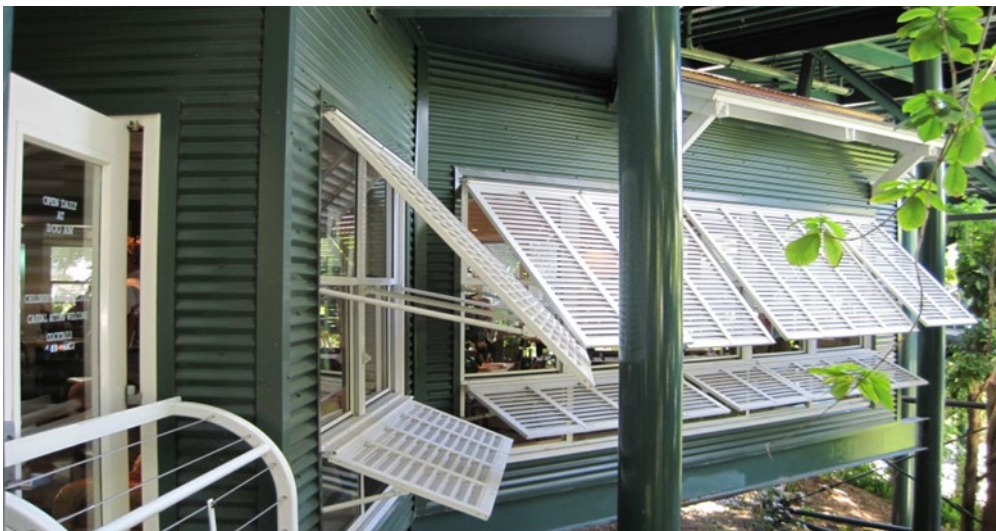
Shutters overhang windows at a facility at the San Diego Zoo.