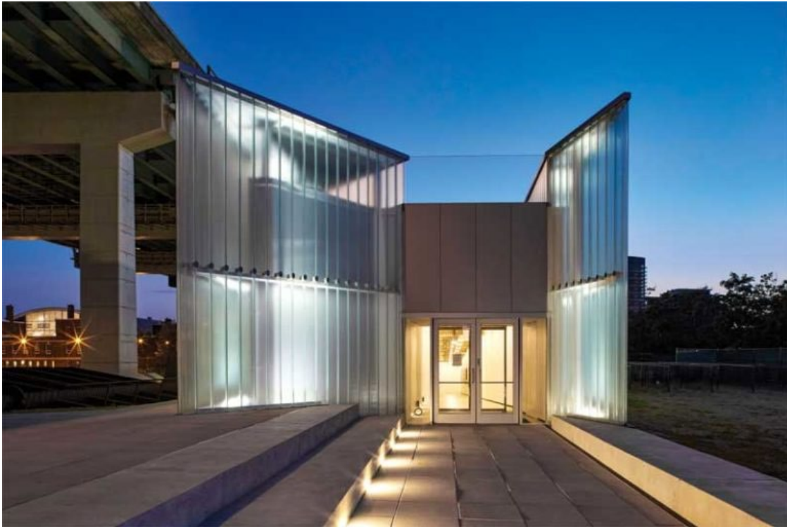
Channel glass can create a visual barrier to birds.

Patterns created by channel glass have demonstrated the ability to reduce bird collisions. Materials are up to 60 percent recycled with low-emissivity coatings, high thermal performance u-value ( >0.17 ) and r-values as high as 5.88. The American Bird Conservancy's webpage provides additional information ( https://abcbirds.org/get-involved/bird-smart-glass/#1 ).