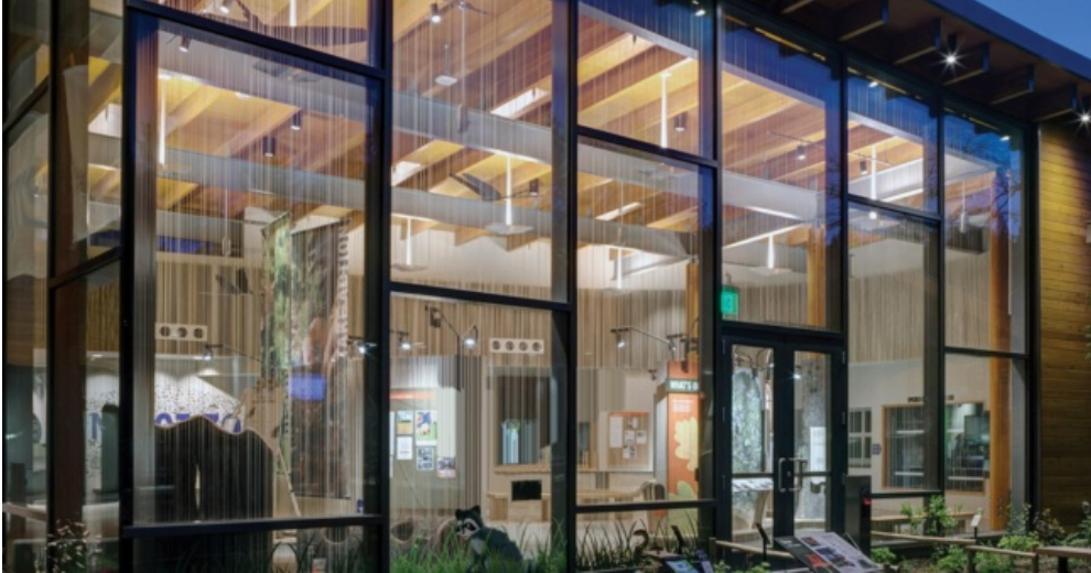
Etched, patterned glass provides a visual barrier to birds.