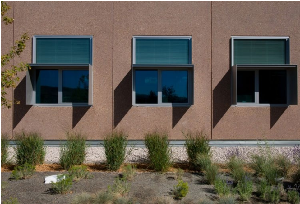
Shading was applied around the windows on the exterior of the Research Support Facility (RSF) at the National Renewable Energy Laboratory (NREL).

Shaded windows allow building occupants access to outdoor views and light but reduce the glass reflections confusing to birds, especially when glass is shaded on all sides. These design features also reduce glare and overheating of the building interior. Awnings, shades, and shutters can be used on new construction, renovations, and retrofits.