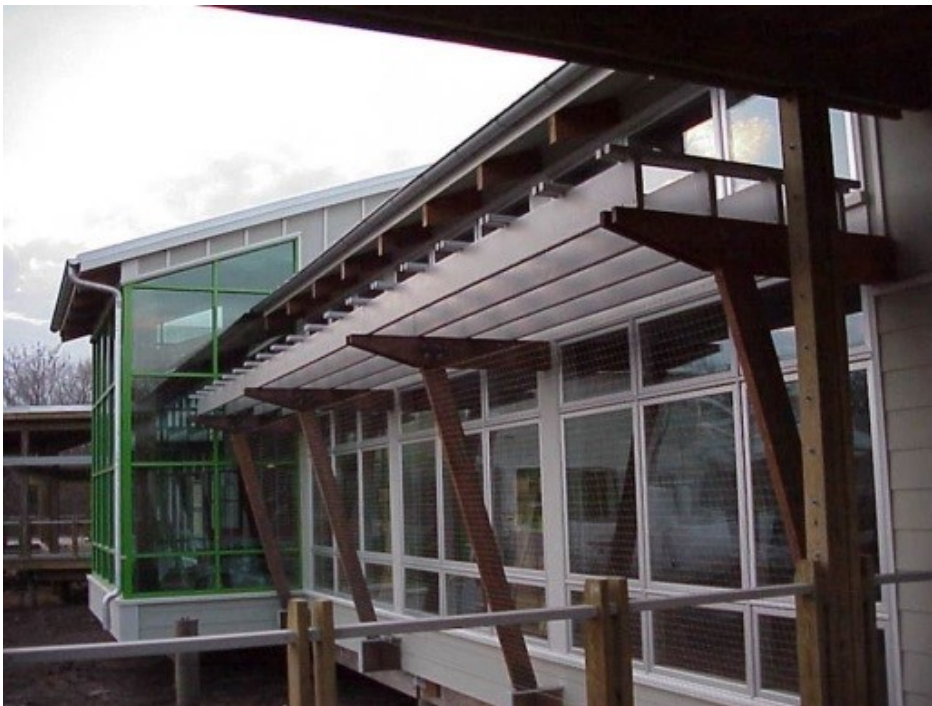
Netting installed on slanted wooden beams.